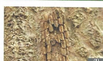
(A) Spotted lanternfly adult showing the forewings and hind wings (B) Adults at rest on bark (C) Lateral view of an adult (D) 1st instar nymph (E) 4th instar nymph (F) Adult feeding on wild grape, Vitis sp. (G) Weeping sap trail on bark (H) Egg mass (oothecum) covered in coating (I) Old hatched egg mass on tree trunk.